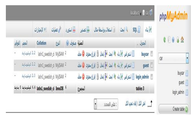
Fig.2. Making database in PHP My Admin on the local server

car_db data base consist of three tables, the first tables for the requests of customers to cars buying, the second table for Remember visitor comments, the third table for admins website.