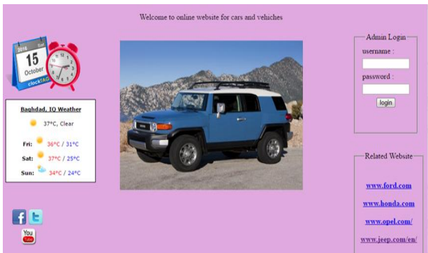
Fig.5. The website body

Website body:the body differs according to the current page, below is the body of the first page as shown in Fig.5