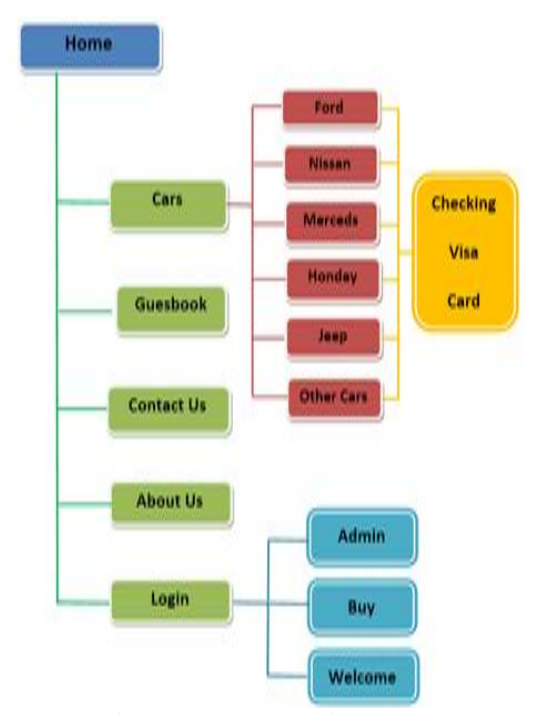
Fig.1. The General Diagram

The structure of the website must be chosen before considering the visuals. The information architecture utilized to describe the planing of a site's structure. There are two kinds of site structures that is that will eventually translate to the navigation menus: wide and deep. In wide navigation system, the main pages are all visible together and for small sites. An alternative method for organizing content is deep navigation, which simplifies the main navigation and groups related pages into categories. The deep navigation system is selected for Online E-commerce website for cars and vehicles, because it is the optimal solution for a large websites, drop-down menus and secondary navigation menu. So the general diagram is delineated in fig.1